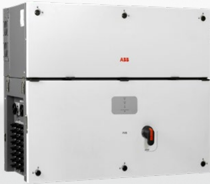
— PVS-100/120-TL three-phase outdoor string inverter

This platform, for extreme high power string inverters with power ratings up to 120 kW, maximizes the ROI for decentralized ground mounted and large rooftop applications. With six MPPT energy harvesting is optimized even in shading situations.