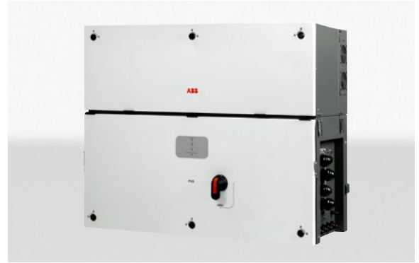
ABB string inverters PVS-100/120-TL 100 to 120 kW